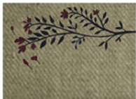
Hand embroidered using Ahimsa embroidery silk