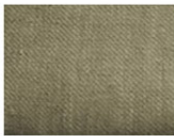
100% Natural linen