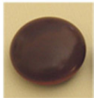
Walnut wood buttons